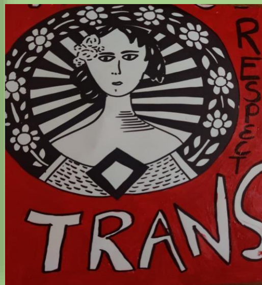
Drawing by LISHA AND URVASHI