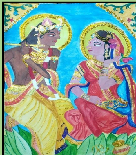
Drawing BY KRITI NARNAG