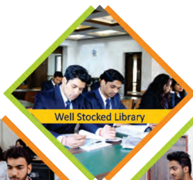
Well Stocked Library