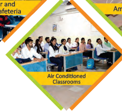
Air Conditioned Classrooms