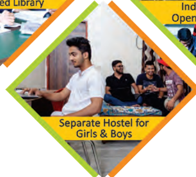
Separate Hostel for Girls & Boys