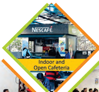
Indoor and Open Cafeteria