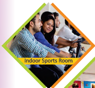
Indoor Sports Room